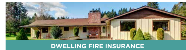
DWELLING FIRE INSURANCE

A Dwelling Fire policy protects owner-occupied and rental residences by offering dwelling coverage. Our policy protects against hazards such as fire, hurricane, windstorm, lightning, and other perils. To tailor this policy to meet your needs, optional personal property and personal liability coverage may be added.